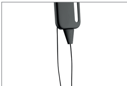
release device with magnets invisibly lockable on the mount