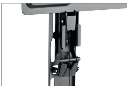
simple release mechanism