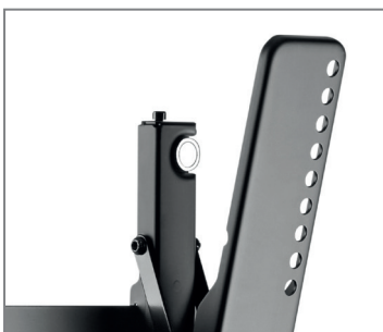
height compensation \pm 8 mm