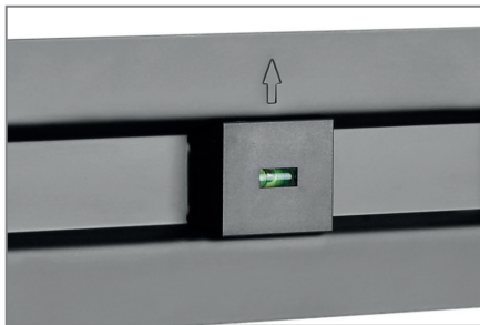
incl. spirit level for a precise alignment of the screen