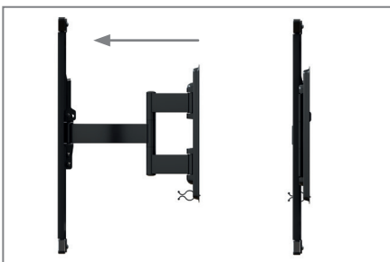
Variable wall distance between 38 and 293 mm