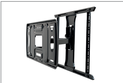
suitable for screens with 40 - 65" | 102 - 165 cm